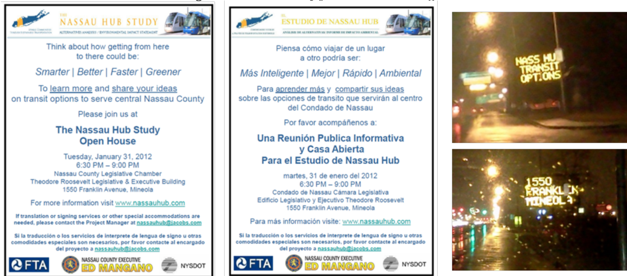
Figure 13-1: Publicity for Public Meeting 1