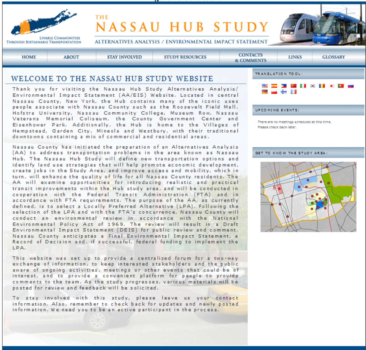
Figure 13-3: Website